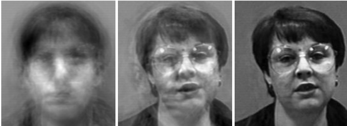
(a) A reconstruction with s = 5 . (b) A reconstruction with s = 19 . (c) A reconstruction with s = 75 .

This \tilde{\mathbf{f}}_i is called the reconstruction of \mathbf{f}_i .