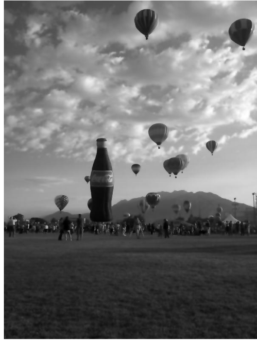
5 iterations with \sigma = .1 and \lambda = .25