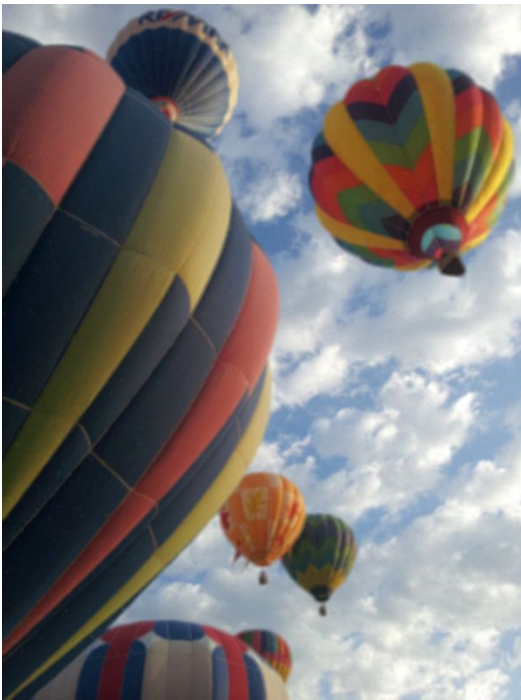
300 iterations of a min-biased scheme