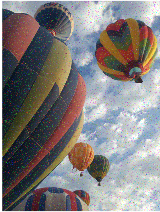
randomly changed 100000 color values